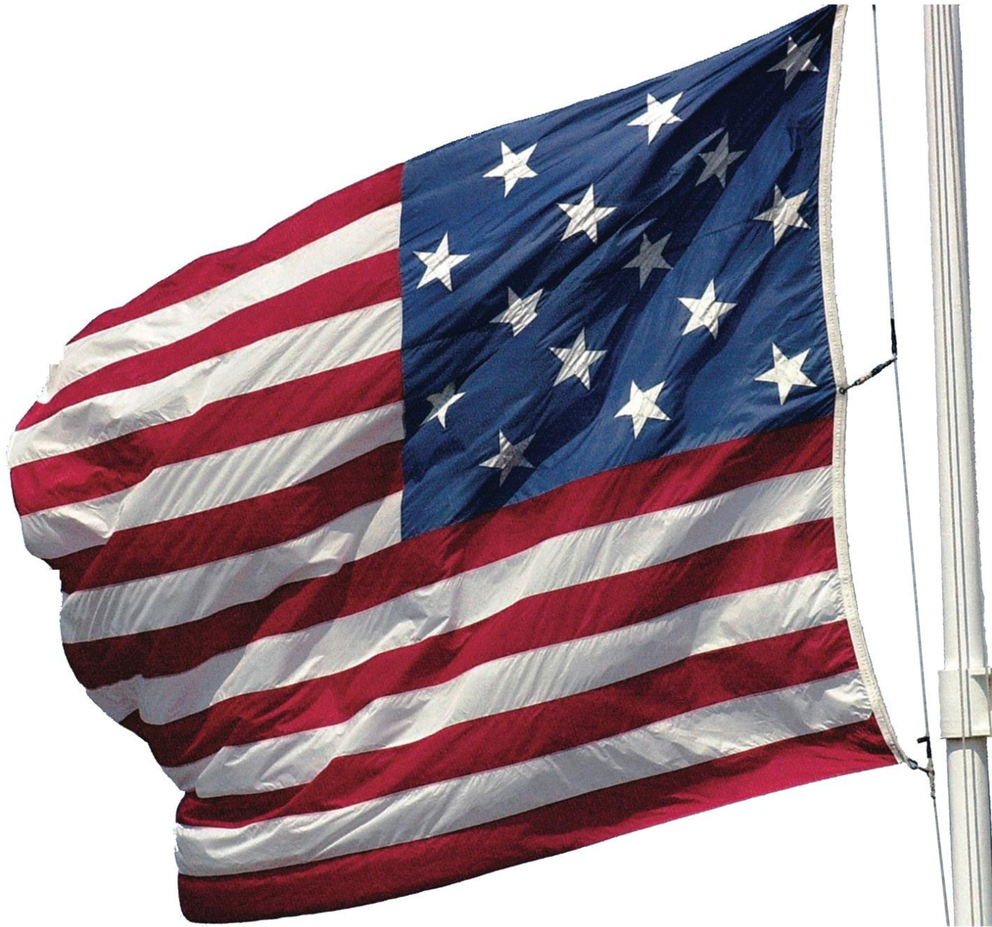
N. Carter/North Wind Picture Archives