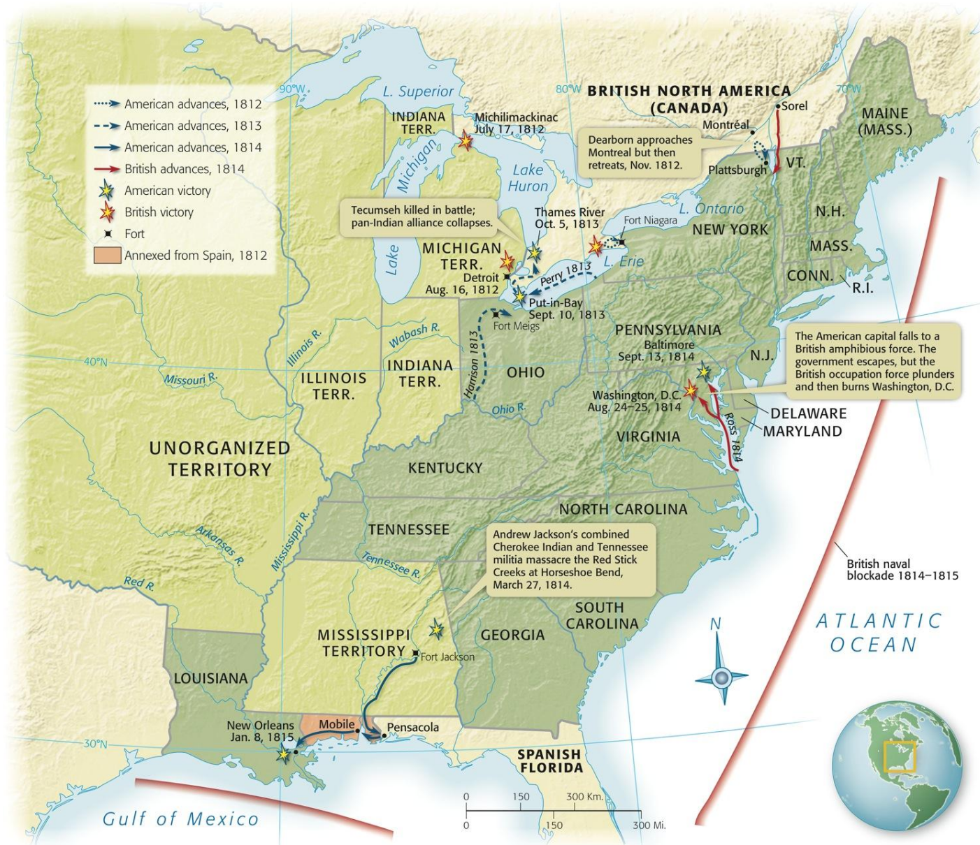
Map 9.2. The War of 1812