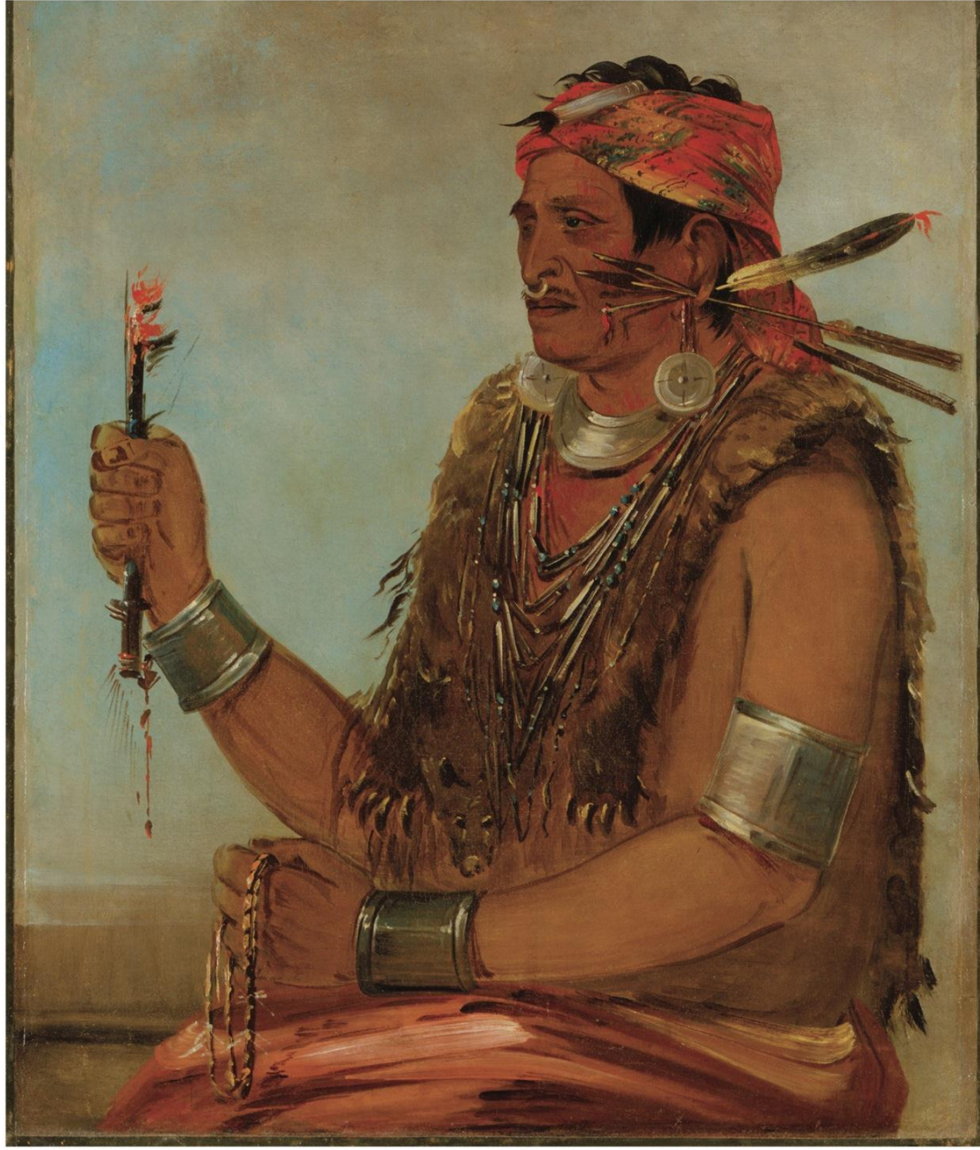
George Caitlin Ten-squat-a-way, The Open Door, Known as The Prophet, Brother of Tecumseh. Shawnee. 1830. Oil on canvas. 29 x 24 in. (73.7 x 60.9 cm) #ART4631