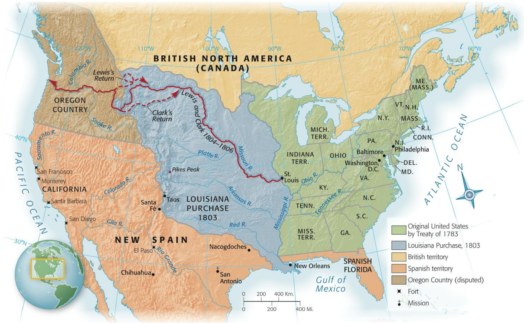
Map 9.1. The Louisiana Purchase