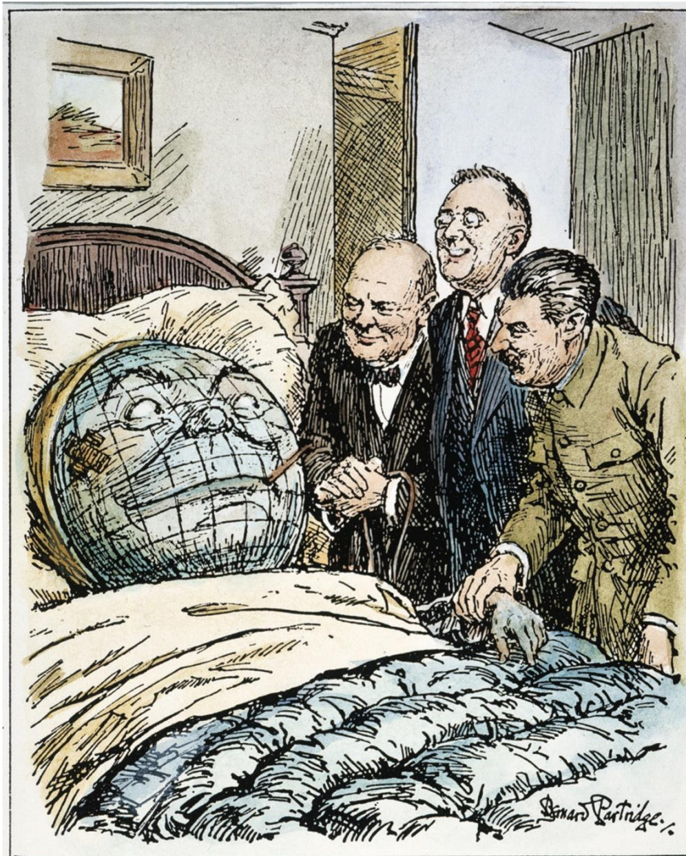
"AND HOW ARE WE FEELING TO-DAY?"