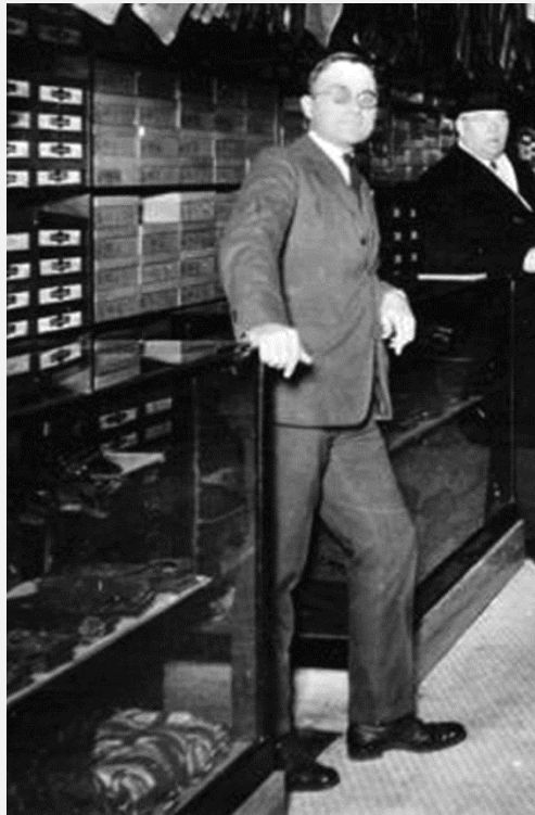
Harry S. Truman Presidential Library and Museum